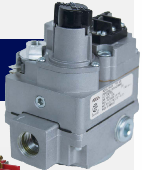
36C03-333 24 VAC standing pilot